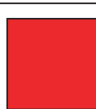
PMS 186 C